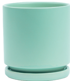
gemstone pot from $28, mommapots.com