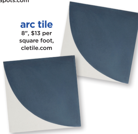
arc tile 8", $13 per square foot, cletile.com