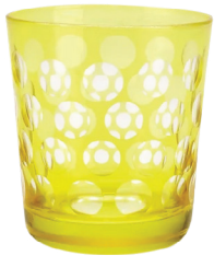
melrose glass Impulse!, $79 for 6, wayfair.com