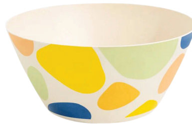
pebbles serving bowl Poketo, $28, mcchicagostore.org