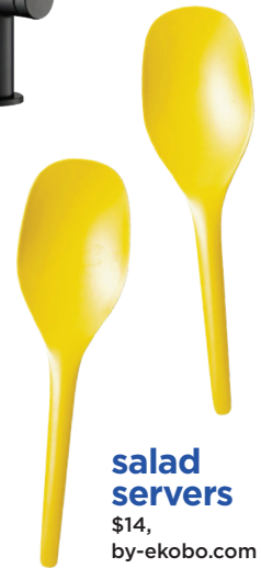
salad servers $14, by-ekobo.com