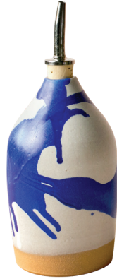
settle oil bottle $64, settleceramics.com