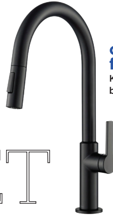
oletto faucet Kraus, $200, build.com