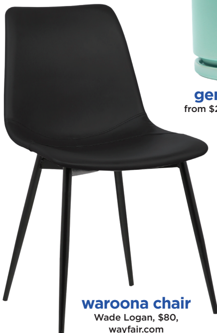
waroona chair Wade Logan, $80, wayfair.com