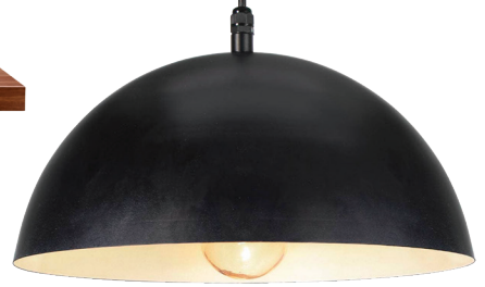
peridot pendant Regina Andrew, 23½" dia., $500, lightology.com