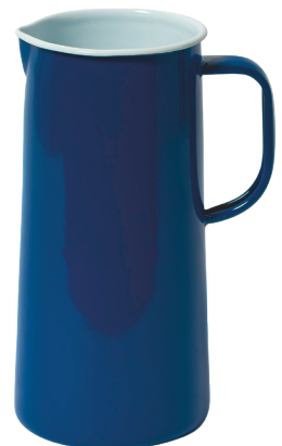
3-pint jug $53, us.falconenameware.com