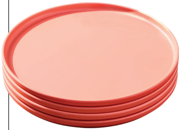
modern melamine plates $42 for 4, westelm.com